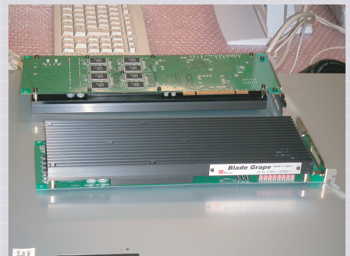
Fig.2 - Blade-GRAPE board (136.8GFLOPS)

The FIRST cluster is a heterogeneous PC cluster, which is designed for effective calculations of astrophysical radiation hydrodynamics. Each node possesses 2 CPUs and a newly-developed GRAVity PipE (GRAPE) processor, Blade- GRAPE, for gravity calculations. Fig. 1 shows the first model of the FIRST cluster, which consists of 16 nodes. The peak speed is 2.4TFLOPS. In two years, 256 (16x16) node PC cluster system will be constructed. The total theoretical speed will be 38.5TFLOPS.