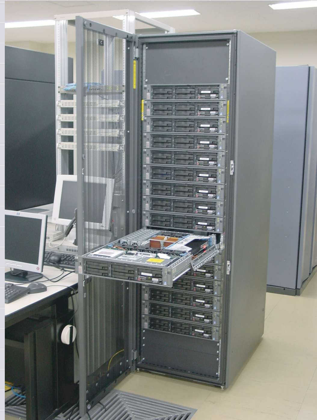
Fig.1 - 16 node model of the FIRST cluster ( 2.4TFLOPS).