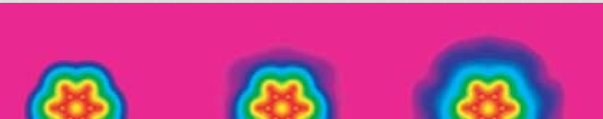
Fig. 3: Density of valence electrons in a naphthalene